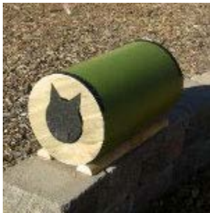
Cylindrical Feral Cat Shelter

Possible Drawbacks: Cost, not as sturdy as more permanent shelters, may not provide adequate protection from predators because of the materials used and large door openings