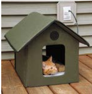
K&H Outdoor Heated Kitty House